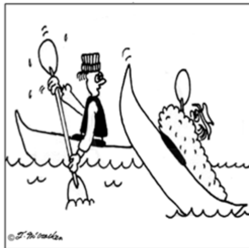
"I told you to keep the rice in a plastic bag."

There are many options available when it comes to size, material and shape of waterproof carriers, but most fall into soft or hard-cased options. Vinyl dry bags come in various sizes, and some feature transparent sides, which is handy to quickly identify items. Boundary bags are a level beyond basic dry bags. Still made with vinyl, boundary bags feature padded shoulder straps to make portaging easy. Hard cases and waterproof marine boxes come in a variety of shapes and sizes and are good for packing lanterns, stoves, cameras and other fragile items.